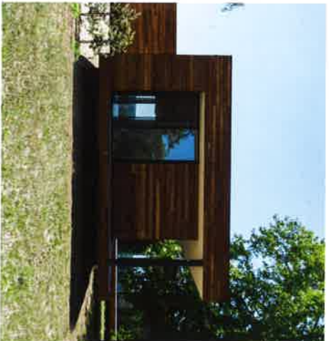
MERRICKS RESIDENCE Intermode Pty Ltd