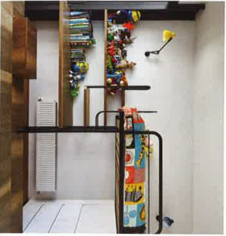
MILLS, THE TOY MANAGEMENT HOUSE Austin Maynard Architects