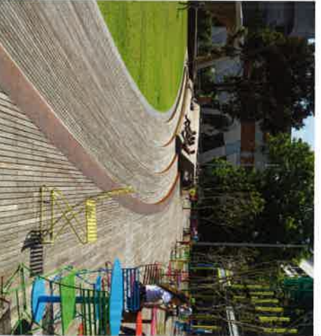
MONASH UNIVERSITY CAULFIELD CAMPUS GREEN EVENTS TERRACE TCL - Taylor Cullity Lethlean