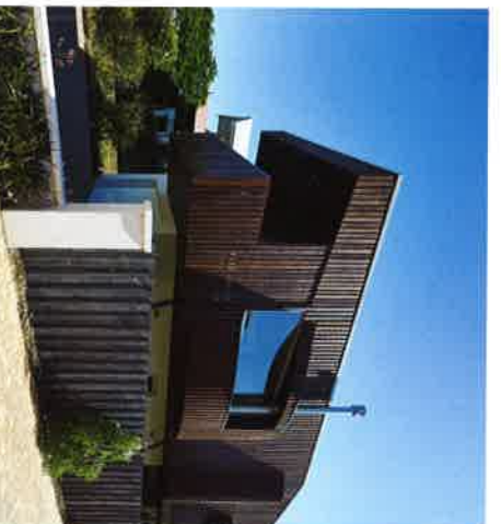
MOSMAN BAY HOUSE iredale pedersen hook architects