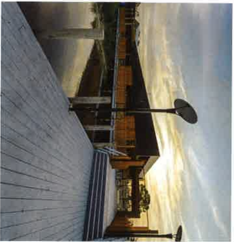
MARIST COLLEGE BENDIGO MONTAGNE CENTRE Y2Architecture