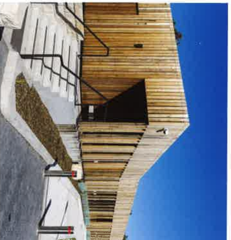
MARKS PARK AMENITIES Cantilever Consulting Engineers / Sam Crawford Architects