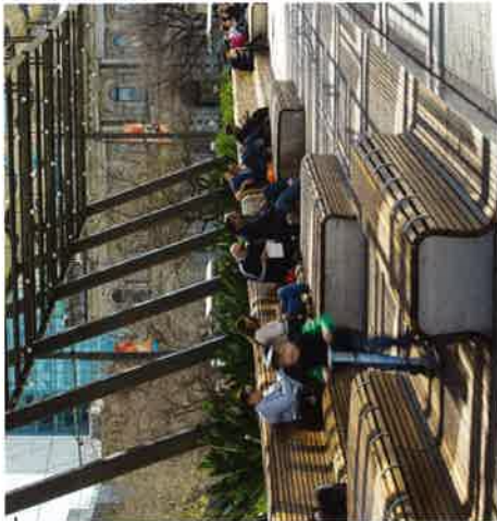
VICTORIA SQUARE / TARNPANYANGGA URBAN REGENERATION PROJECT