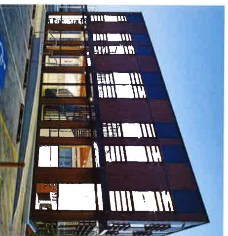
MEYER TIMBER OFFICE NSW TBS (Timber Building Systems)